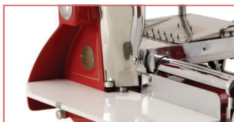
Removable stainless steel slice receiving tray for total hygiene