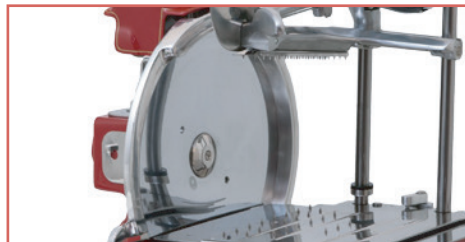
360° blade guard for safety